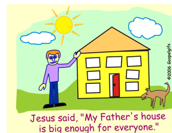
Jesus said, "My Father's house is big enough for everyone."